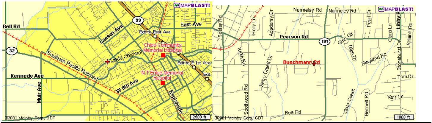
Alamo LDS Chapel-Chico