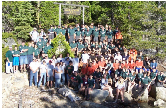
Overdrive 2007 – Camp Winton

Comments gathered from Venturers at Overdrive 2009