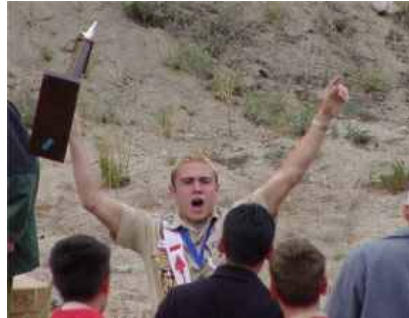
Amangi Nacha Lodge Chief Receives Bald Eagle Trophy at 2002 W3B Conclave

Each year the section puts on a Conclave. A weekend of fun and fellowship. It is hosted by one of the six lodges which rotates each year. The host or service lodge, along with the section Council of Chiefs (COC) plan and organize the event. The Section COC is made up of the lodge chiefs from each of the mem-