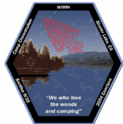
2004 W3B Conclave Patch